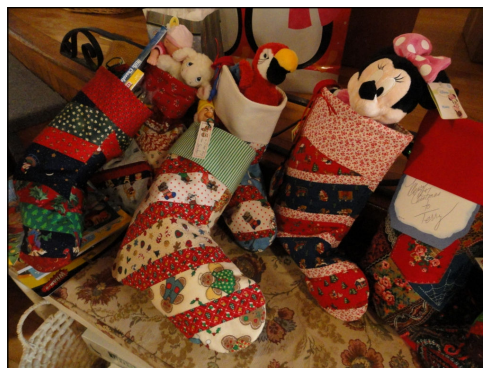
Some of the Christmas Stockings made and filled by the Peace Makers group.

Changing Hearts. Changing Lives. One Girlfriend at a time.