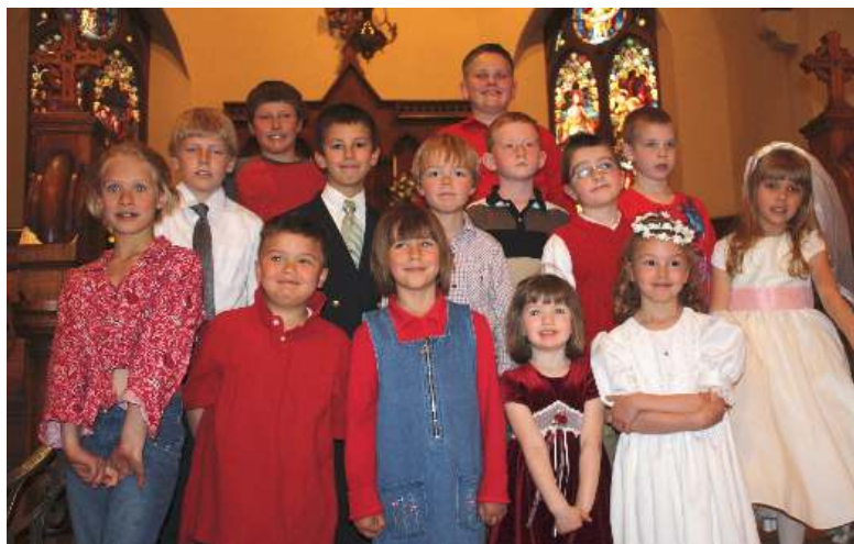
Children recently completed a communion class