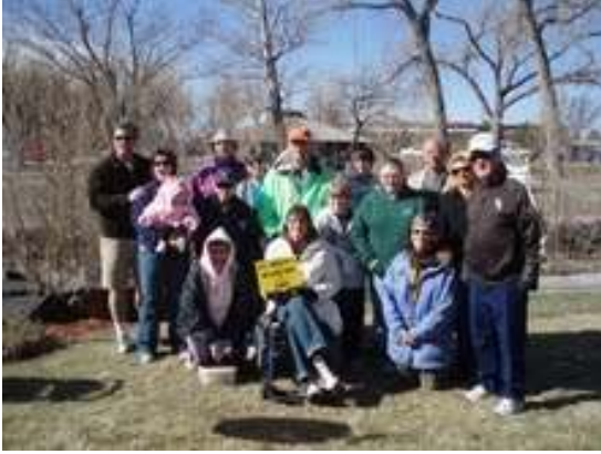
2010 St. Mark's MS Walk Team