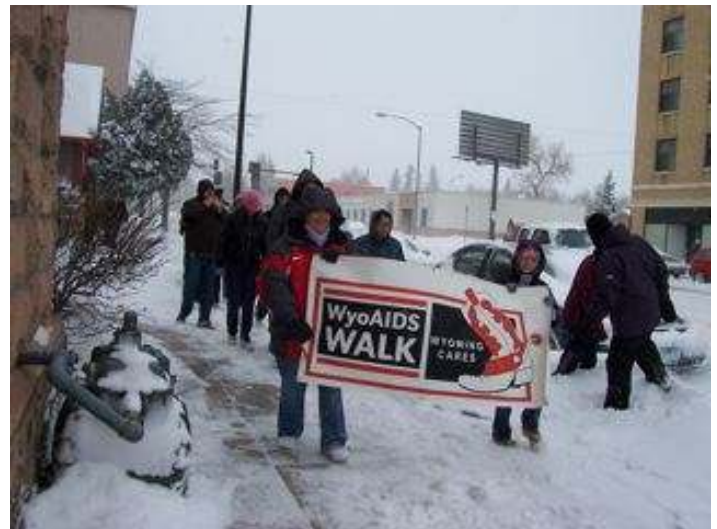
Several people participated in the Wyoming AIDS Walk even though it was one of the coldest days in Cheyenne.