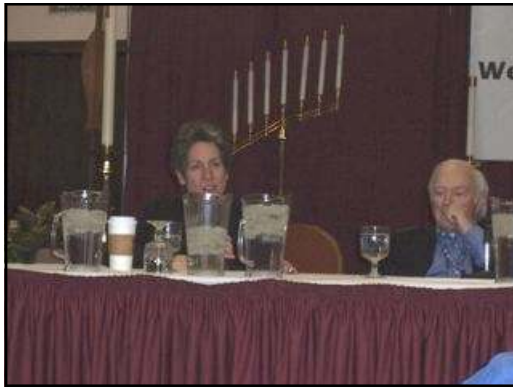
Presiding Bishop Katherine Jefferts Shori