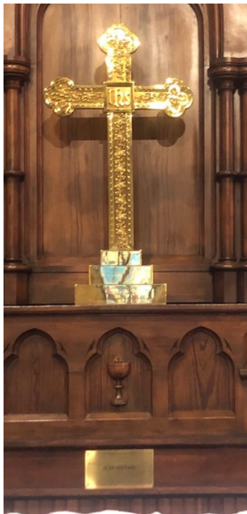
Cross acquired circa 1970 and currently in use in the church.

Turning our attention to the reredos (the wooden fixture behind the altar), it is engraved, "Holy, Holy, Holy, Lord God of Hosts" across its middle. At one time, the altar and reredos were connected. During a major renovation of the chancel at some time in the mid-1960's, the altar was placed in its current position. This allowed the Celebrant to face the assembly rather than having his (at that time exclusively male) back to them. Arguments for and against ad orientem (facing east) and versus populum (facing the people, typically west) go back centuries. However, since the 1960's, versus populum has become the norm in the large majority of Episcopal churches and in most Anglican Provinces with the notable exception of Ireland.