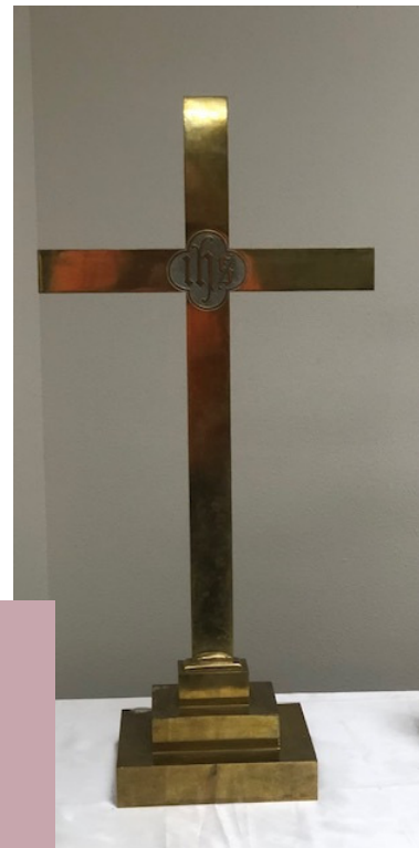
Cross that was in use when first service was held in the "new" church (8/19/1888) and currently in use in the Children's Chapel.